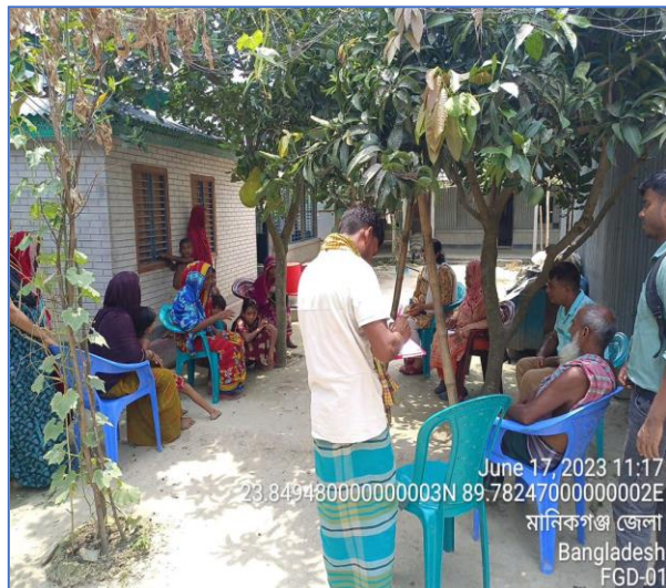
Figure 5: Focus group discussion with affected household members